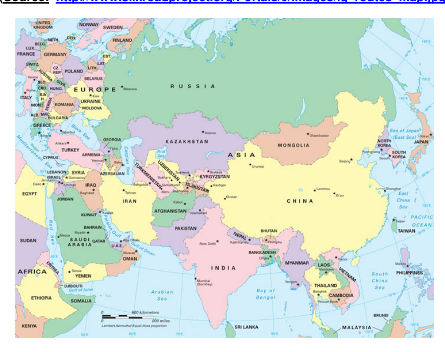
Current political map