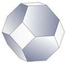
2. Truncated octahedron