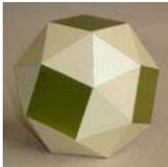
9. Snub cube