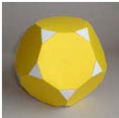
4. Truncated dodecahedron