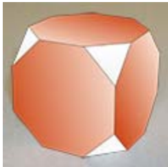
3. Truncated hexahedron (or truncated cube)