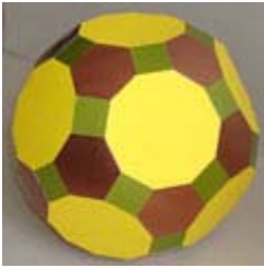
12. Truncated rhombicosidodecahedron