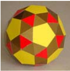
13. Snub dodecahedron