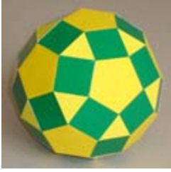
11. Truncated icosidodecahedron (Small rhombicosidodecahedron)