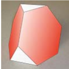
1. Truncated tetrahedron