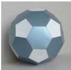
5. Truncated icosahedron (like a soccer ball, but flat faces)