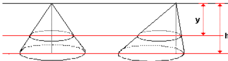
Figure illustrating Cavalieri's Principle

We shall now apply this principle to cones. Suppose we have an oblique cone as on the right hand side of the figure below. On the left hand side suppose we have a right circular cone with the same height and a circular base whose area is equal to that of the elliptical base for the second cone.